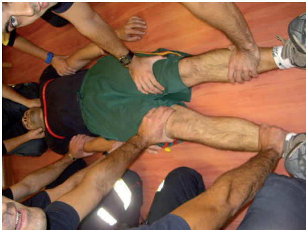
Figure 2. Manual restraint by five people; one holds the patient's head while the other four each restrain one extremity.

Intensive care patients may require physical restraint to avoid treatment interruption or monitoring; this can involve wrapping the hands in cotton wool and bandages (like "boxing gloves"), which allows free movement of the arms but restrains the fingers, or the patient's extremities may be tied to the bed rails 11 .