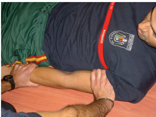
Figure 3. Close-up view showing manual restraint of the upper left arm, immobilizing the shoulder and elbow.

The indication for urgent chemical therapy and the route of administration will depend on the degree of agitation and the tentative diagnosis. Generally, parenteral administration is chosen, with intravenous (IV) injection being preferred for its rapid effect as compared with intramuscular (IM) injection. However, obtaining an IV access in patients with acute psa may be difficult and usually requires prior physical restraint. If the oral