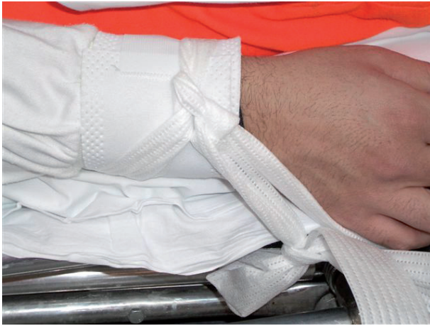
Figure 5. Close-up view showing wrist restraint tied to the bed rails.

ment for such effects, so in emergency situations it is preferable to use those with which the team has had most experience.