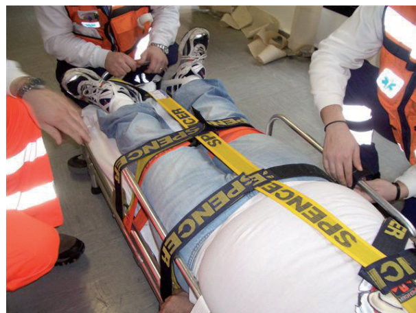
Figure 9. Patient restrained with a spider harness.

doses of 25-50 mg IM (never IV), every 2-4 hours until sedation or maximum safe dose of 200 mg.