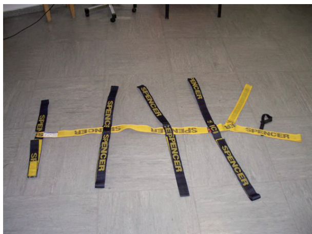
Figure 8. Spider harness.