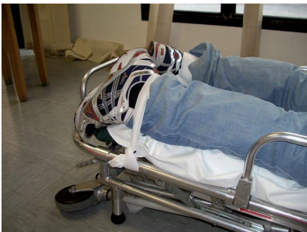
Figure 6. Close-up view showing ankle restraint tied to the bed; the patient is in the prone decubitus position.