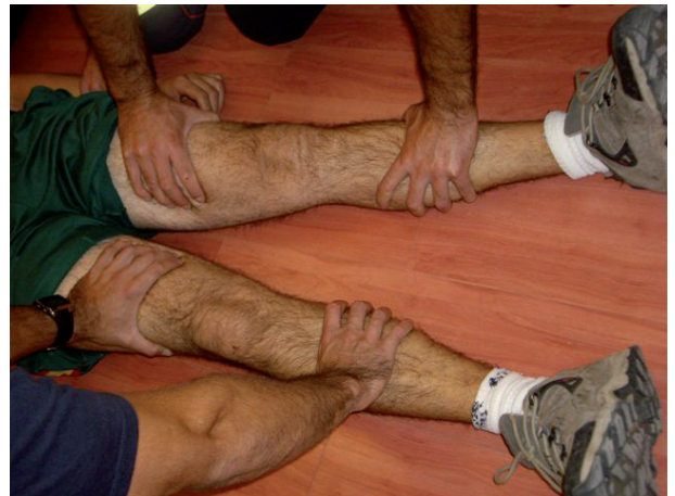
Figure 4. Close-up view showing manual restraint of the lower limbs.

route is chosen, ideally it should be in liquid form and ingestion can be checked. The sublingual route is also efficient in this situation. Studies indicate that 64% of ED psychiatric patients prefer psychotropic medication to restraint or confinement 25 .