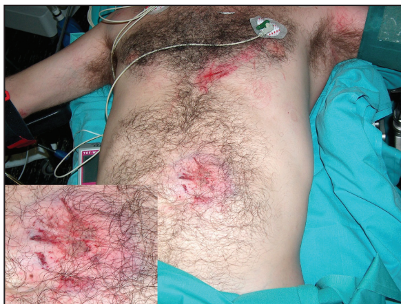
Figure 1. Image of the patient showing apparent integrity of the abdominal wall. In the box (lower left side), detail of the contused area with ecchymosis and erosion but without solution of continuity of the skin.

Contained evisceration caused by sheathed goring we diagnosed and emergency surgery was performed. During the operation the CT scan findings in the abdominal wall were confirmed – evisceration –, the abdominal organs were checked following the usual method and the damaged muscle